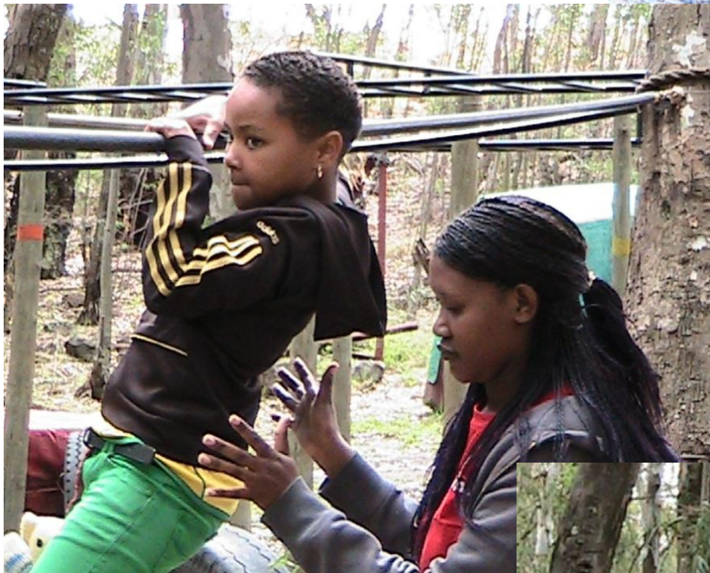
Challenge and Triumph on the Ropes Course